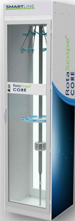
RotaScope Core ROTA-CO-T