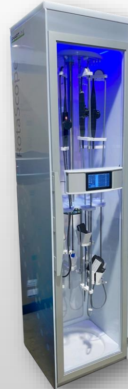
RotaScope Classic ROTA-T-S